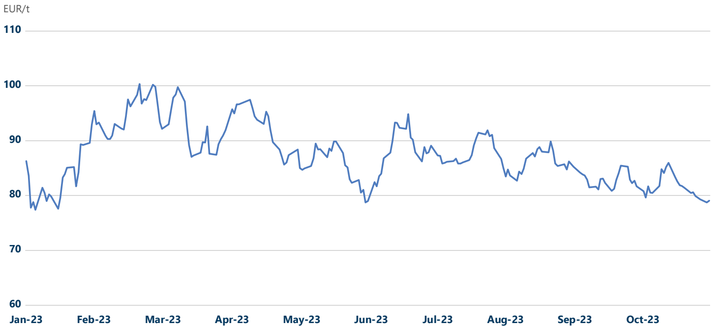
EU Allowances Price Trend in 2023

In October, the EU carbon price mirrored the trajectory of natural gas prices, initially surging before experiencing a decline. Based on EEX data, the EUA futures DEC23 contract climbed from 80.8 euros at the start of the month to its peak of 85.95 euros on October 13, before gradually dropping to 78.72 euros, marking the lowest point for the year by the month's end. During the first half of the month, several factors contributed to an upswing in expectations for increased natural gas demand, including the escalation of the Israel-Palestine conflict, damage to the Finnish natural gas pipeline, and a notable drop in expected temperatures across much of Europe. These dynamics propelled a rapid upturn in carbon prices.