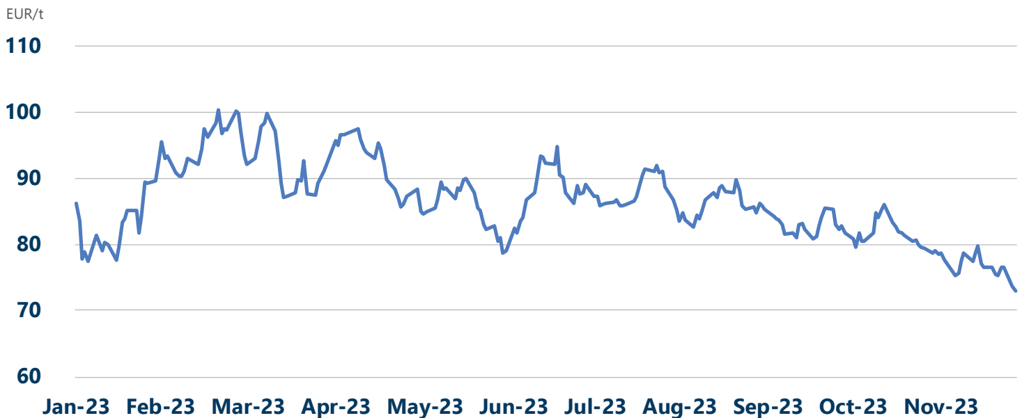
EU Allowances Price Trend in 2023

In November 2023, the EU carbon price experienced a 7.1% decrease, from €78.54 per tonne at the beginning of the month to €72.96 per tonne at the end. The average daily price for the month was €76.7 per tonne, down 5.92% from October and up 0.59% from November 2022.